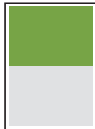
1/2 Page 7.5 x 4.5