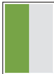
1/2 Page 3.625 x 10