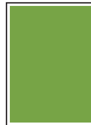
Full Page 7.5 x 10