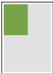
1/4 Page 3.625 x 4.5